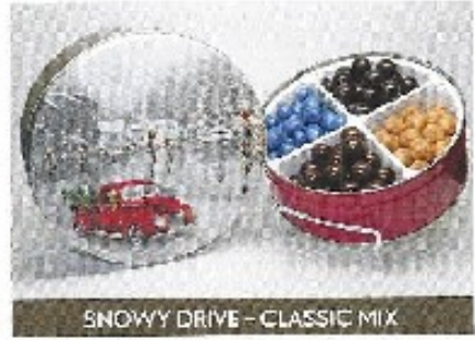
SNOWY DRIVE - CLASSIC MIX

Milk, Marionberry, Cherry Hazelnuts and Chocolata-covered Blueberries Item 29420 2.3oz $21.95