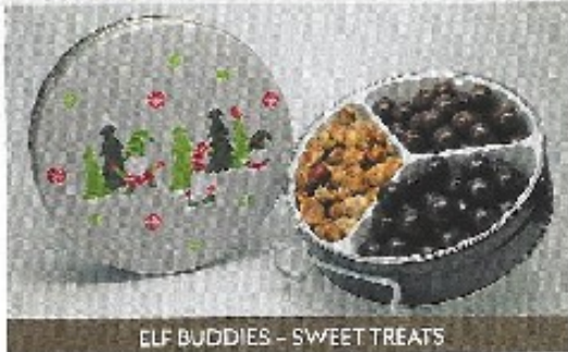
ELF BUDDIES - SWEET TREATS

Butter Toffee, Milk & Dark Hazelnuts Item 38676 13oz $14.95