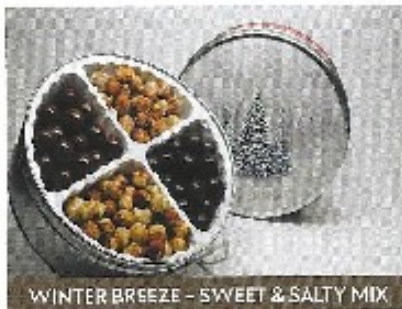
WINTER BREEZE - SWEET & SALTY MIX

Milk, Dark and Salted Hazelnuts Item 20295 13oz $14.95