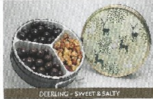
DEERLING - SWEET & SALTY

Butter Toffee, Milk & Dark Hazelnuts Item 38676 13oz $14.95