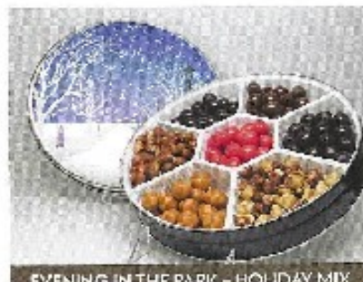
EVENING IN THE PARK - HOLIDAY MIX

Butterscotch, Milk, Dark Hazelnuts and Chocolate covered Blueberries Item 39967 2.3oz $21.95