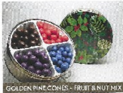
GOLDEN PINE CONES - FRUIT & NUT MIX

Milk, Dark, Salted, and Butter Toffee Hazelnuts Item 05957 2.3oz $21.95