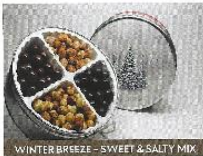
WINTER BREEZE - SWEET & SALTY MIX

Milk, Dark and Salted Hazelnuts Item 20295 13oz $14.95