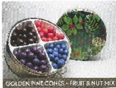
GOLDEN PINE CONES - FRUIT & NUT MIX

Milk, Dark, Salted, and Butter Toffee Hazelnuts Item 05957 23oz $21.95