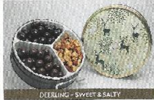
DEERLING - SWEET & SALTY

Butter Toffee, Milk & Dark Hazelnuts Item 38676 13oz $14.95