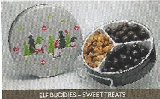
ELF BUDDIES - SWEET TREATS

Butter Toffee, Milk & Dark Hazelnuts Item 38676 13oz $14.95