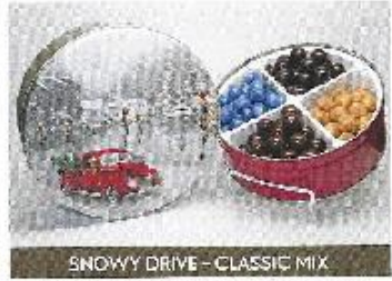
SNOWY DRIVE - CLASSIC MIX

Milk, Marionberry, Cherry Hazelnuts and Chocolate-covered Blueberries Item 29420 23oz $21.95