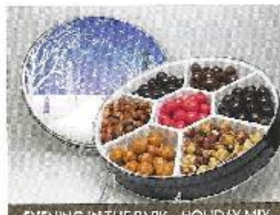
EVENING IN THE PARK - HOLIDAY MIX

Butterscotch, Milk, Dark Hazelnuts and Chocolate-covered Blueberries Item 39967 23oz $21.95