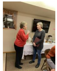
Friends in faith

United Methodist Women Thanksgiving Dinner A time for connecting with friends, a time to share good food with friends and a time for God's spirit in the season for all.