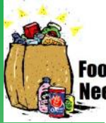
Food Pantry Needs